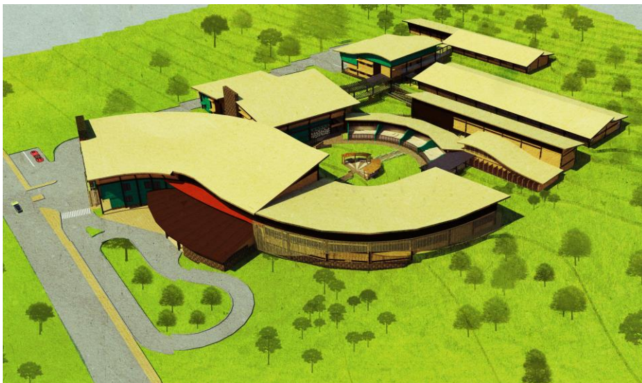
Figure 11. Aerial site perspective. (Image rendered by author)