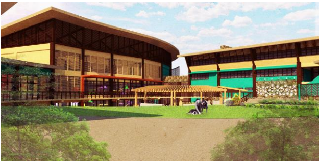
Figures 6 and 7. Views of Veterinary Hospital from parking area (above) and outdoor park (below). (Image rendered by author)