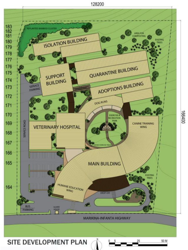
Figure 2. Proposed Site Development Plan of PARC. (Image rendered by author)