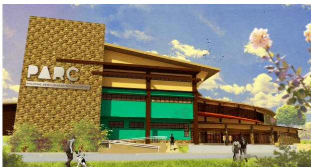
Figure 1. Rendered image of proposed Main Building façade. (Image rendered by author)

Key Words: Animal, Rehabilitation, PARC, PAWS, Animal shelter