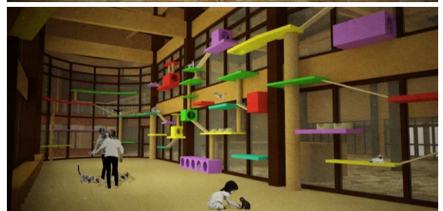
Figures 3 and 4. Interior perspectives of Main Lobby and Cattery. (Images rendered by author)