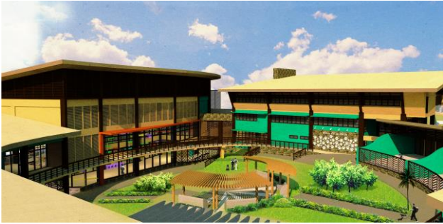
Figure 5. Aerial perspective of Exercise and Recreation Park.