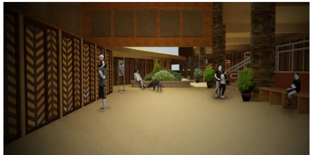
Figures 9 and 10. Perspectives of Adoption Building. (Image rendered by author)