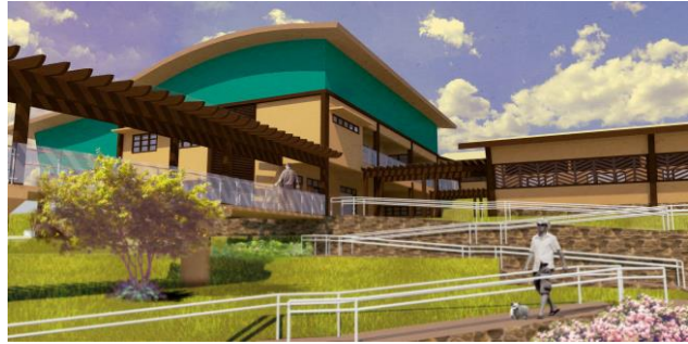
Figure 8. Perspective of Support and Quarantine Buildings. (Image rendered by author)